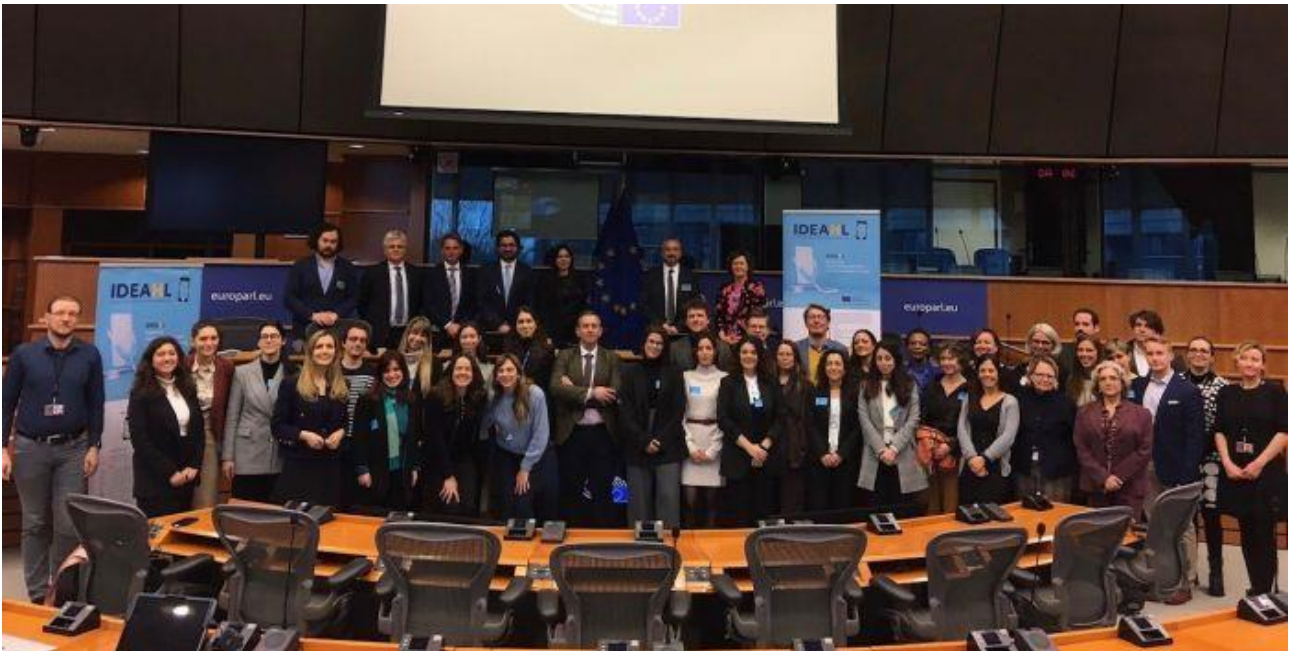
Policymakers and IDEAHL project partners attending the High-Level Event at the European Parliament in Brussels on 7 March, 2023.