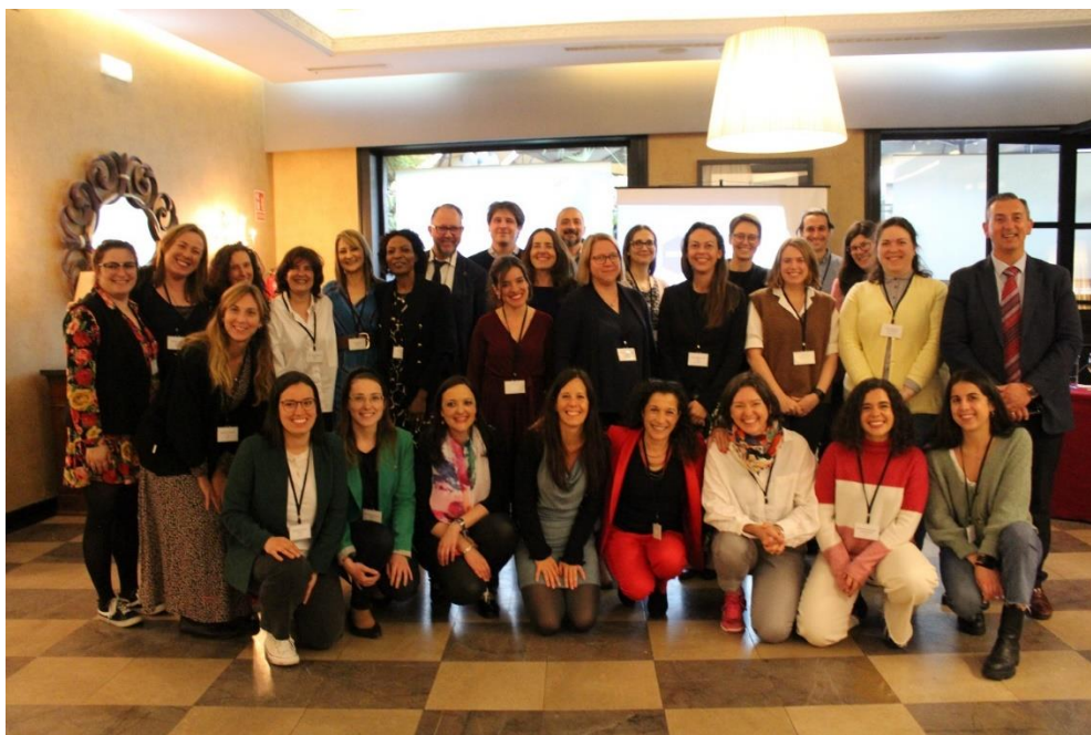
Family photo of members participating in the Kick Off meeting in Oviedo held on 24 and 25 May, 2022.

Useful documents and meeting presentations are available HERE .